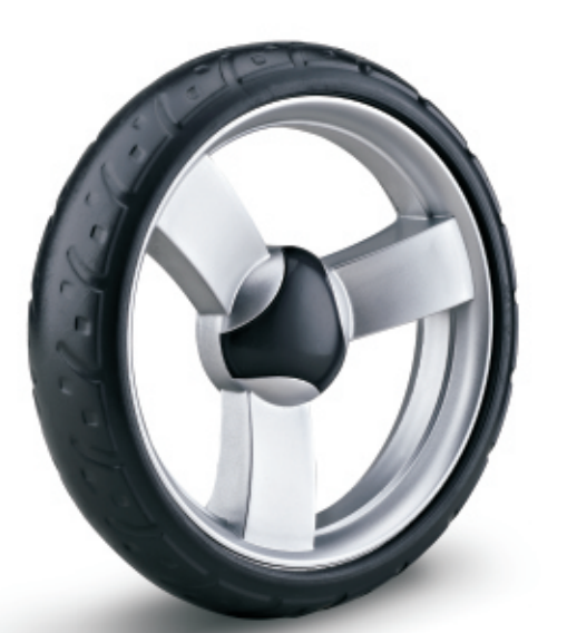
YS-305 series 三星輪