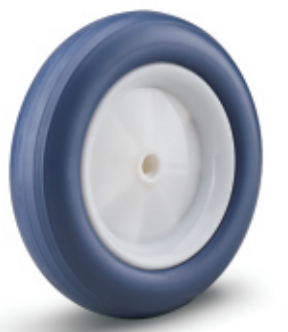
YS-202 series 215輪 YS-202-4.5*-1-E (116mm*27mm)