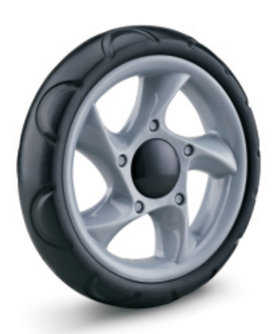
YS-39 series 越野輪