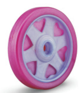
YS-209 series 雙色心心輪 YS-209-3"-1 (74mm*13mm)