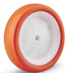
YS-205 series 517輪 YS-205-4"-1-E (100mm*27mm)