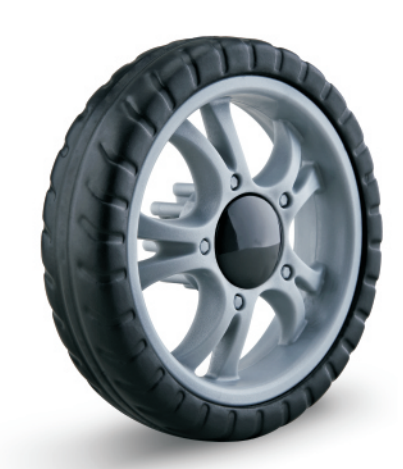
YS-101 series 如意輪