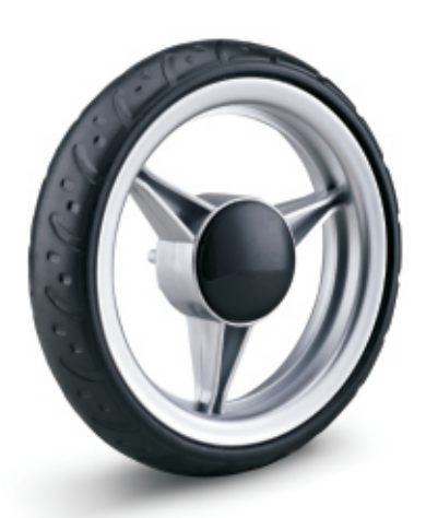
YS-70 series 新賓士輪