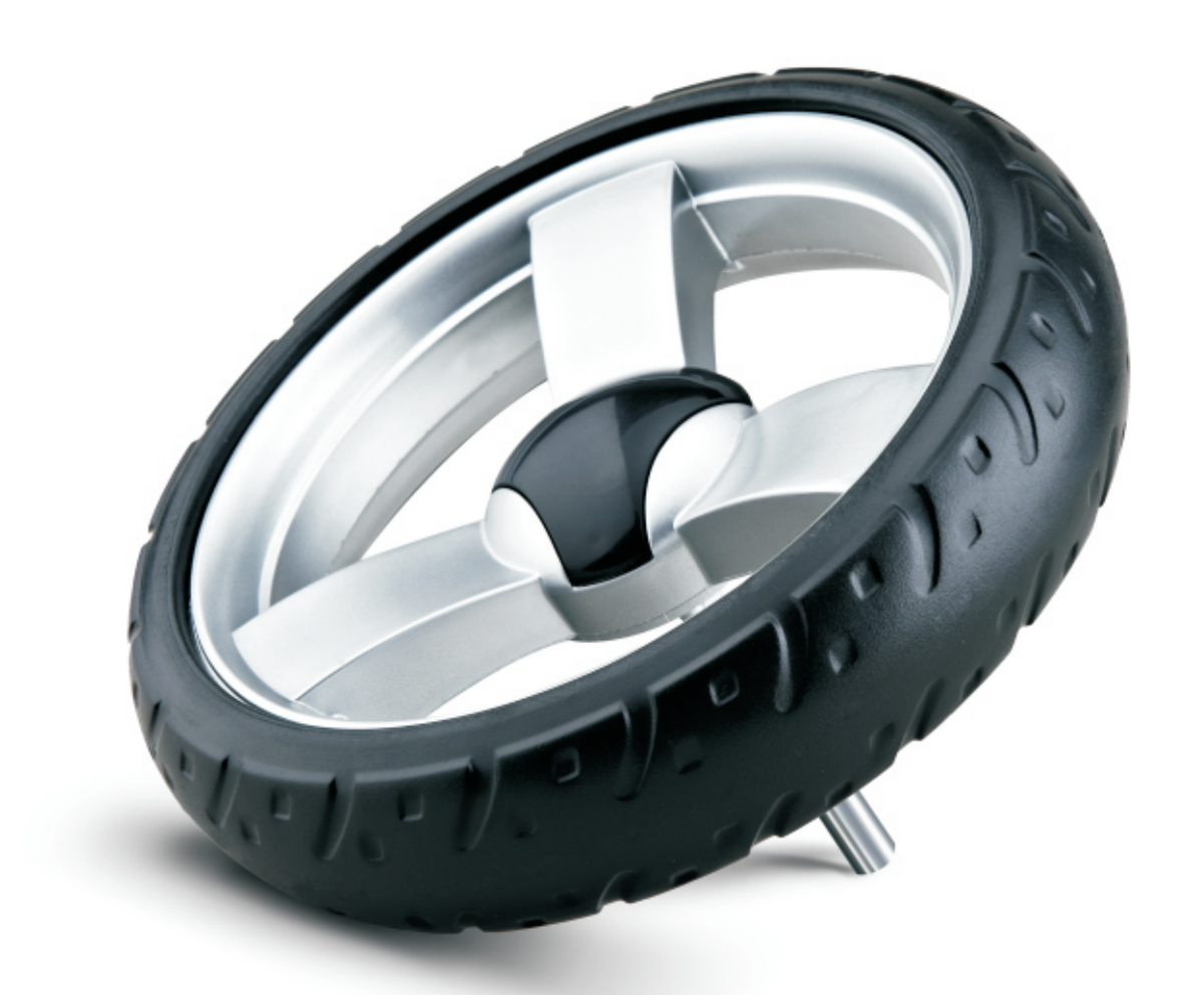
Turning forward, revolving dreams.