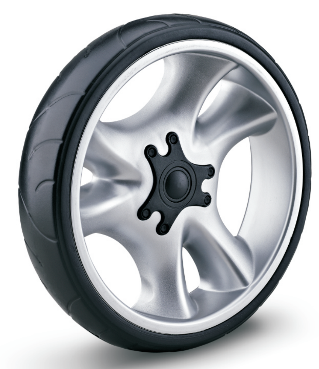
YS-308 series 皮卡輪