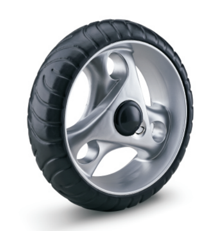
YS-86 series 雙角輪(中空胎)