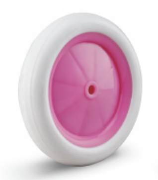
YS-200 series 302輪 YS-200-4.5"-1-E (112mm*22mm)