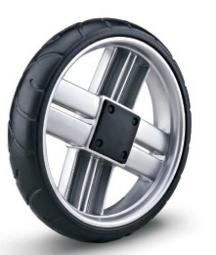
YS-312 series 騎士輪