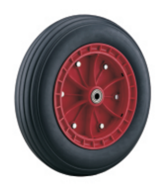
工業用輪 wheel for Agricultural/Industrial equipment