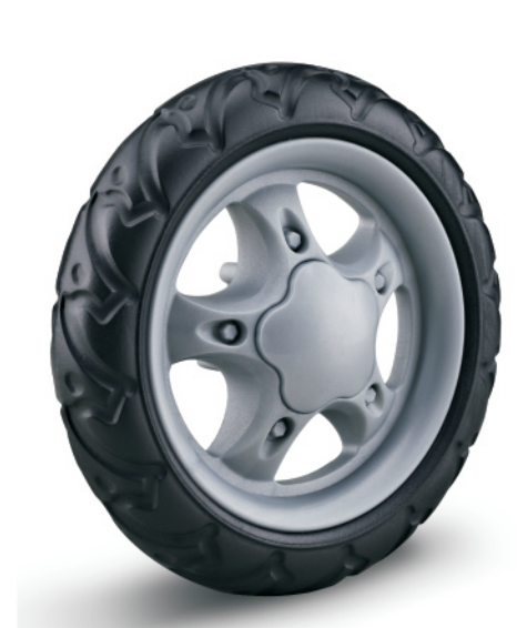
YS-83 series 五瓣輪