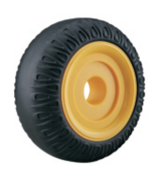
兒童三輪車厚輪 wheel for Trikes