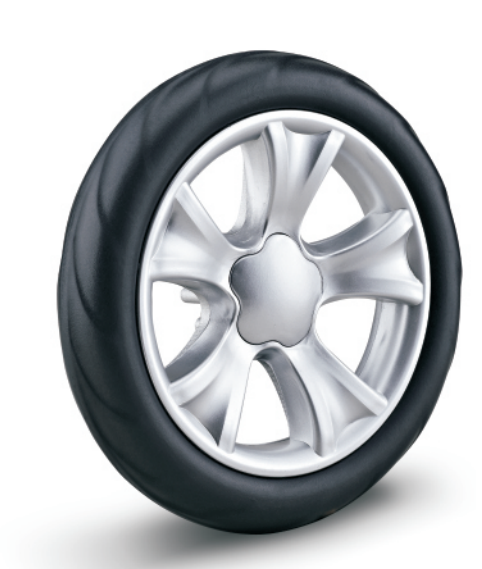
YS-82 series 花瓣輪