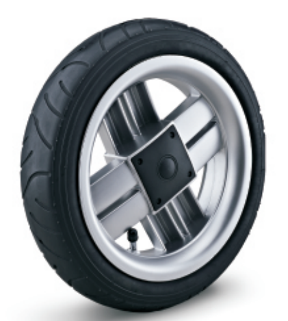
YS-312 series 騎士輪(打氣胎)