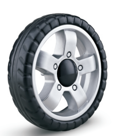
YS-100 series 吉祥輪