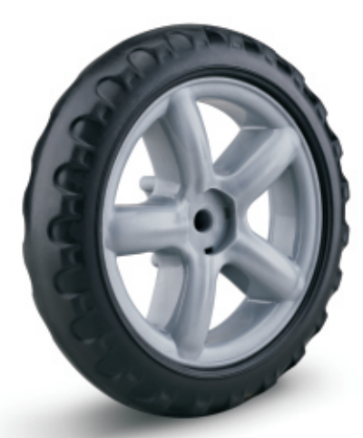
YS-317 series 海星輪