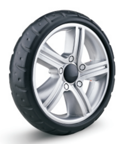
YS-330 series 飛旋輪