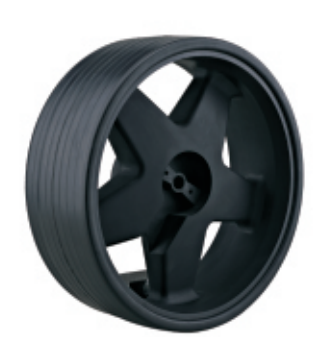
高爾夫球車輪 wheel for Golf Trolley