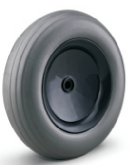
YS-201 series 201輪 YS-201-4.5*-1-E (118mm*32mm)