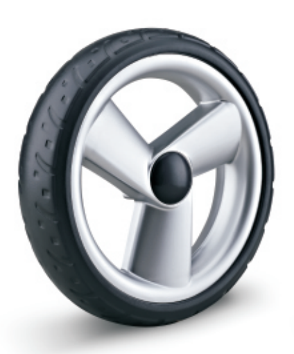
YS-329 series 旋風輪