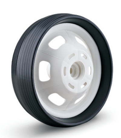
YS-108 series 高爾夫球輪