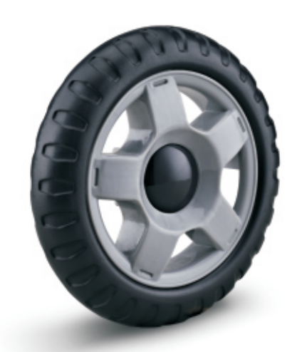
YS-10 series 五爪輪