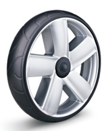
YS-318 series 大衆輪 (B pattern) (B花紋)