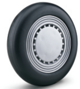
YS-207 series 503輪 YS-207-5.5"-1-E (140mm*34mm)