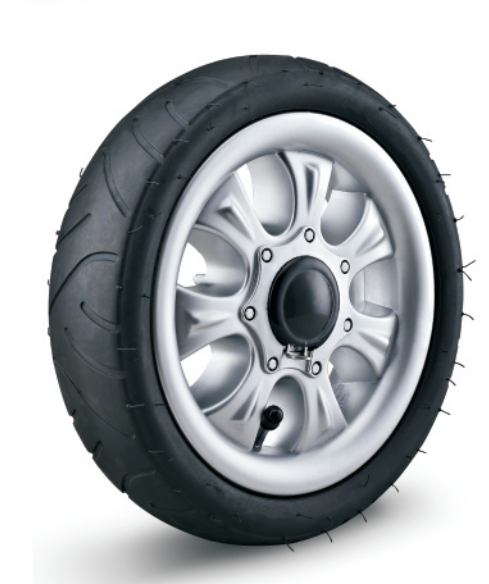
YS-84 series 七瓣輪(打氣胎)