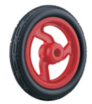
兒童脚踏車輪 wheel for Children Learner Bike