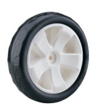
兒童拖車輪 wheel for Wagon