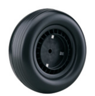
吸塵器用輪 wheel for Vacuum Cleaner