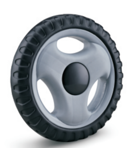
YS-35 series 賓仕輪