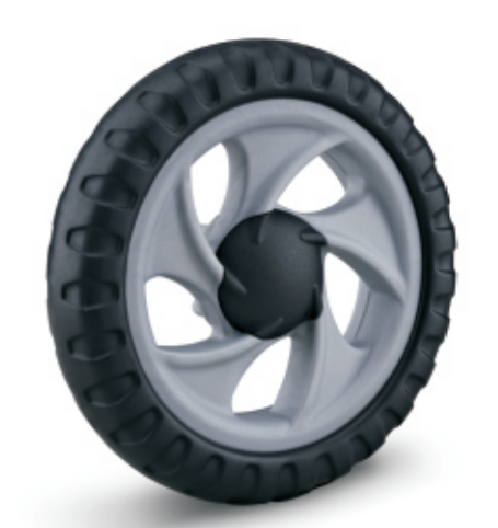
YS-6 series 五孔旋風輪