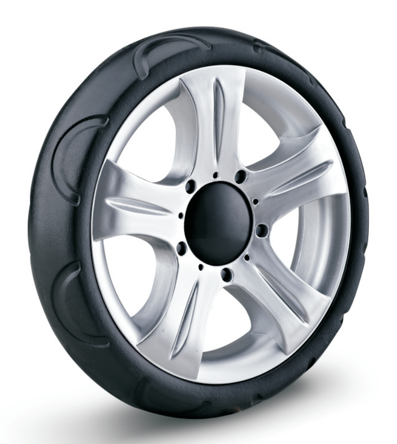
YS-103 series 柳葉輪