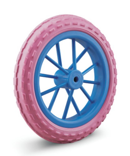
YS-45 series 足球輪 YS-90 series 仿鋼絲輪