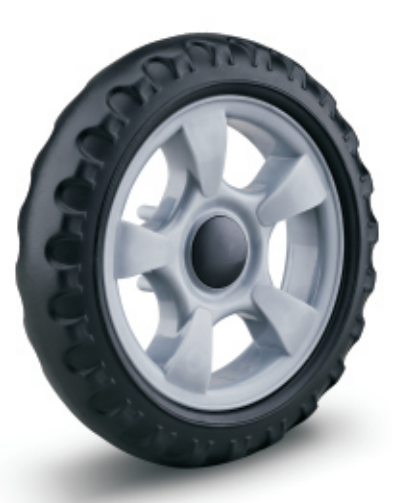
YS-316 series 星空輪