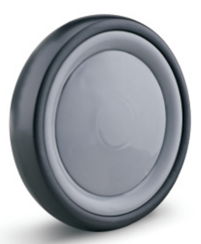
YS-331 series 光面輪