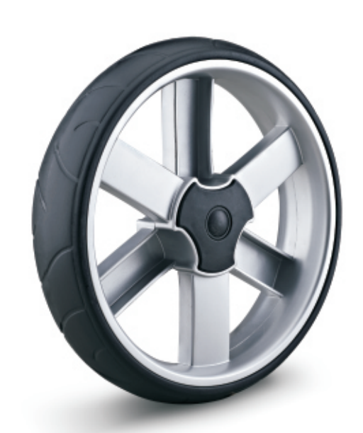
YS-313 series 騰飛輪