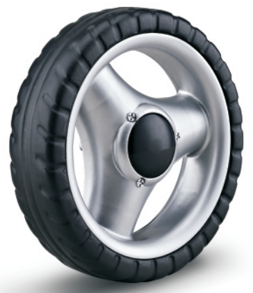
YS-85 series 三爪輪