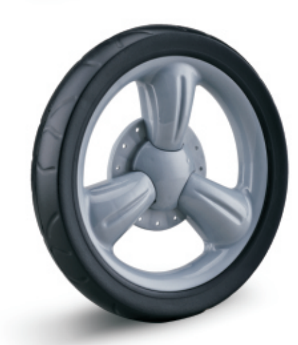
YS-335 series 祥和輪