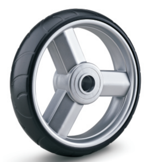
YS-315 series 中部輪