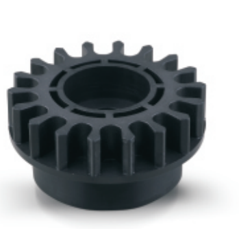
刹車齒 Brake Adapter