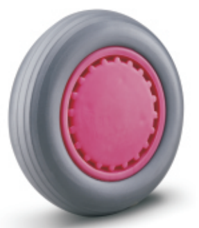
YS-203 series 203輪 YS-203-4.5"-1-E (120mm*32mm)