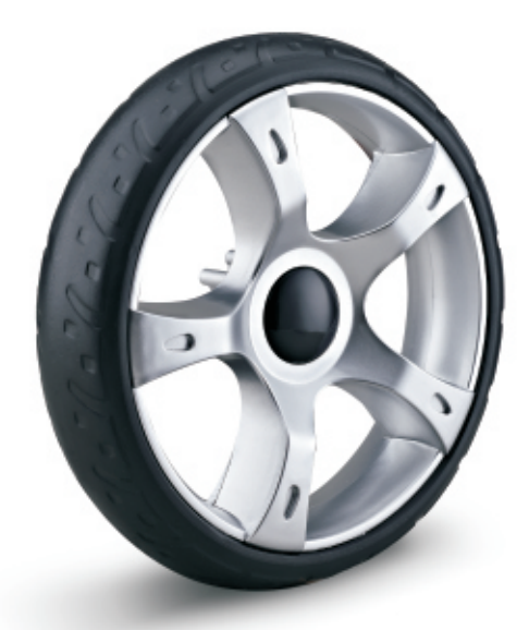
YS-306 series 五星輪