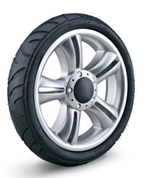
YS-309 series 凌志輪(打氣胎)